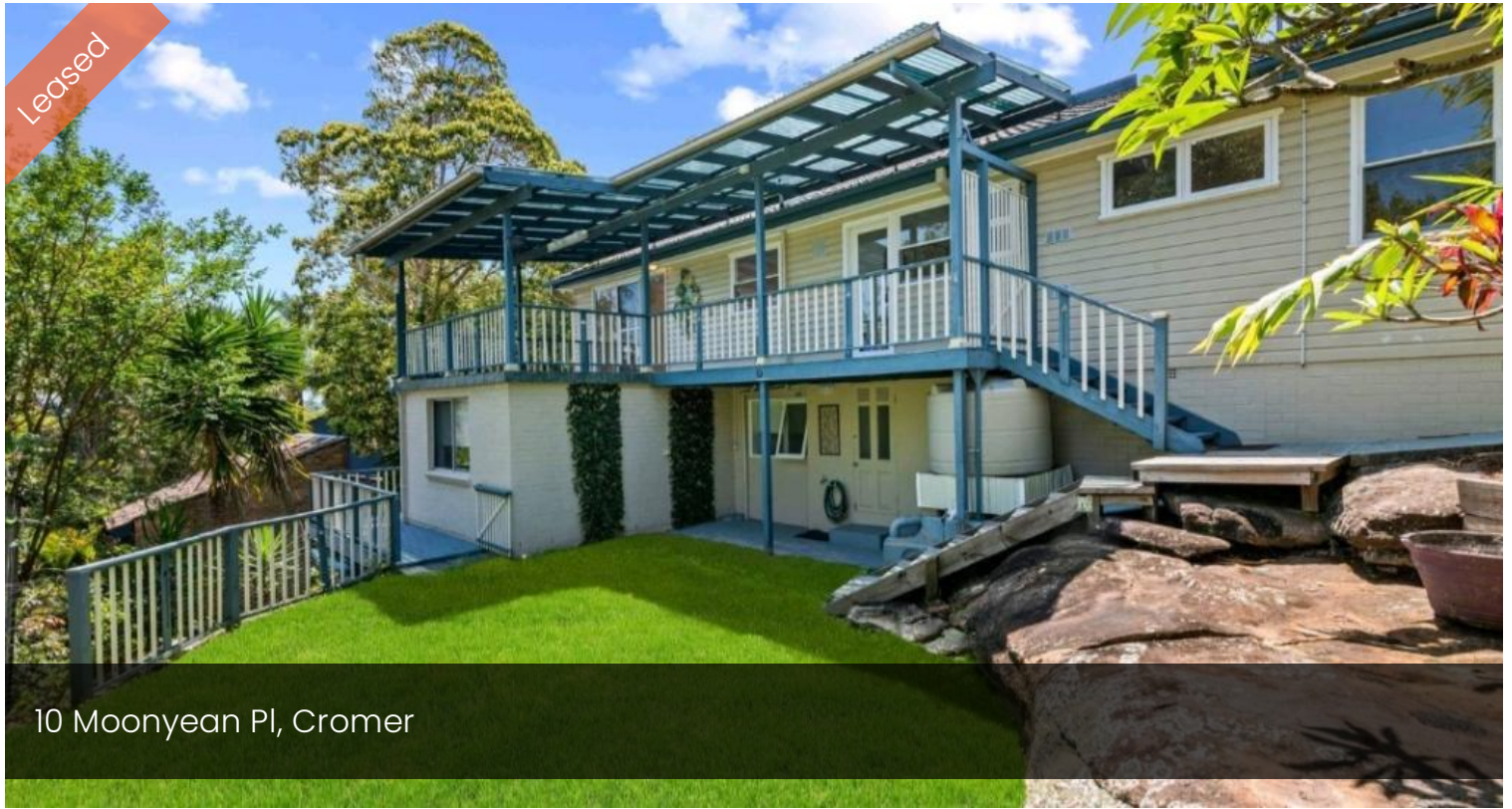
10 Moonyean Pl, Cromer