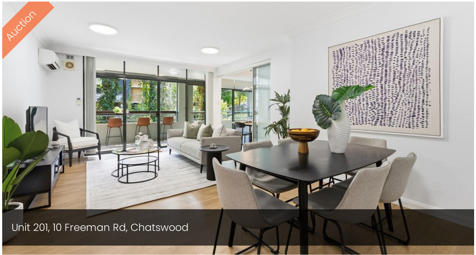
Unit 201, 10 Freeman Rd, Chatswood