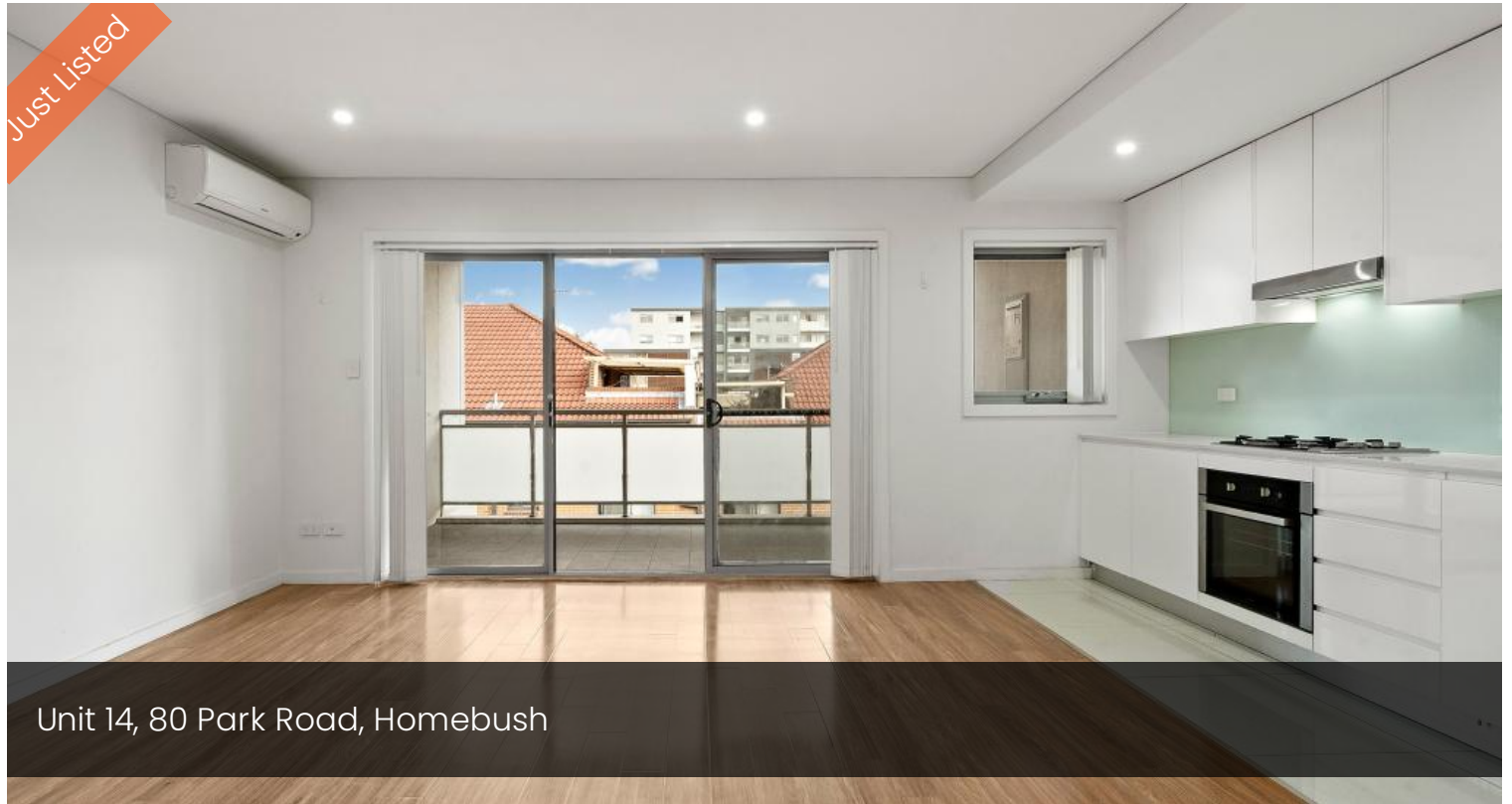
Unit 14, 80 Park Road, Homebush